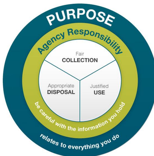
Figure 1: The Office of the Privacy Commissioner’s conceptual diagram of information for agencies